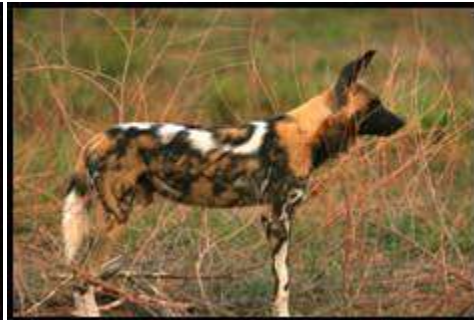
Zero, king of the six-pack