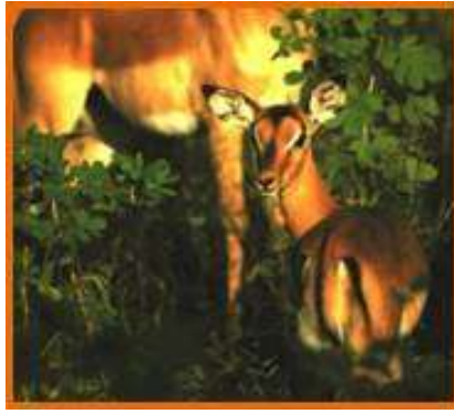
Splashes of gold