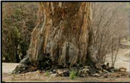
The pack of twenty