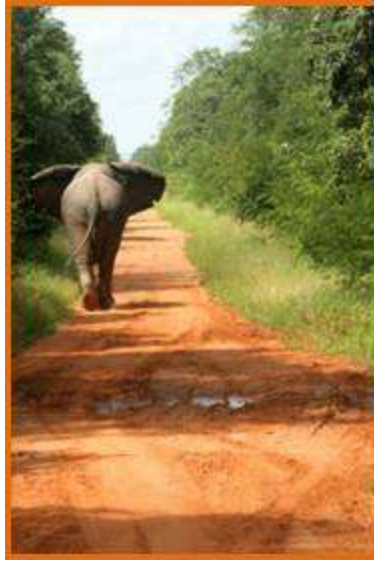
The road less-travelled

Moving onto smaller creatures, the shorter days and cooler temperatures will soon stir something within the minds of the migratory birds. At a signal unbeknown to the greatest of human minds, they'll pack up their bags, hitch up their feathers and set off for their summer homes to the north. No GPS, 747 auto-pilot or blonde could or should ever hope to compete with a bird-brain. We always eagerly await the return of the migrants in summer but in the meantime we have the deep whooping and mud-sucking calls of the snipes on the island to lull us to sleep, offset perfectly by the reed frogs' tenor clinks that bounce off the stars of the clear winter nights.