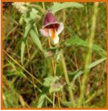
In the pink